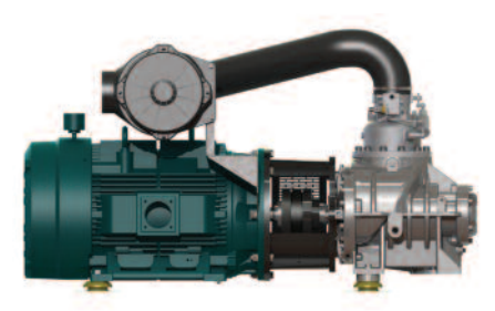
Variable Speed Direct Drive

The VSD also integrates numerous power monitoring and fault protection technologies, such as: Integrated EMC filter, line reactor, phase loss and overload protection.